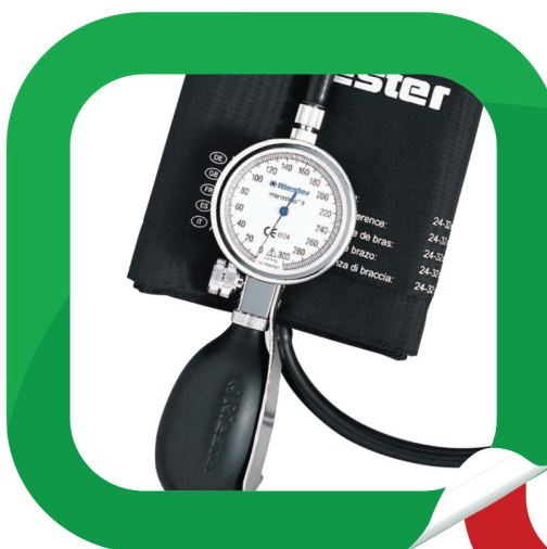
Blood pressure sets