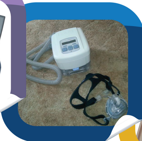
Sleep Apnoea Solutions