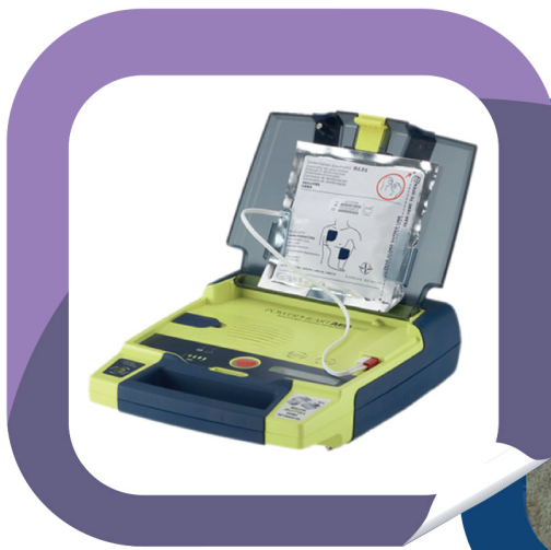
Automated External Defibrillator