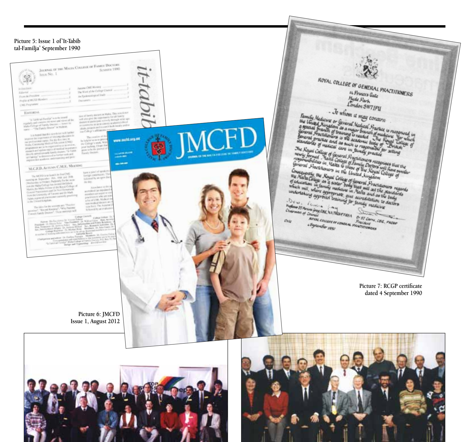
Picture 8: MCFD-RCGP Workshop on Counselling in Family Practice 1995