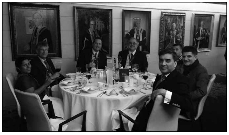
International Development Day at the Royal College of General Practitioners 2015