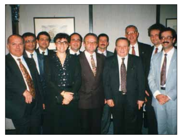
Picture 1: MCFD Council members & guests at 5th Anniversary Dinner 1994

by the Malta College of Family Doctors (1990-2015)